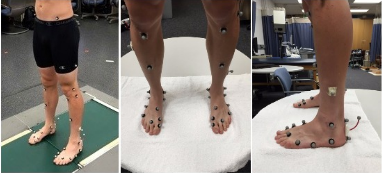
Figure 2. Vicon Oxford Foot Model marker placement