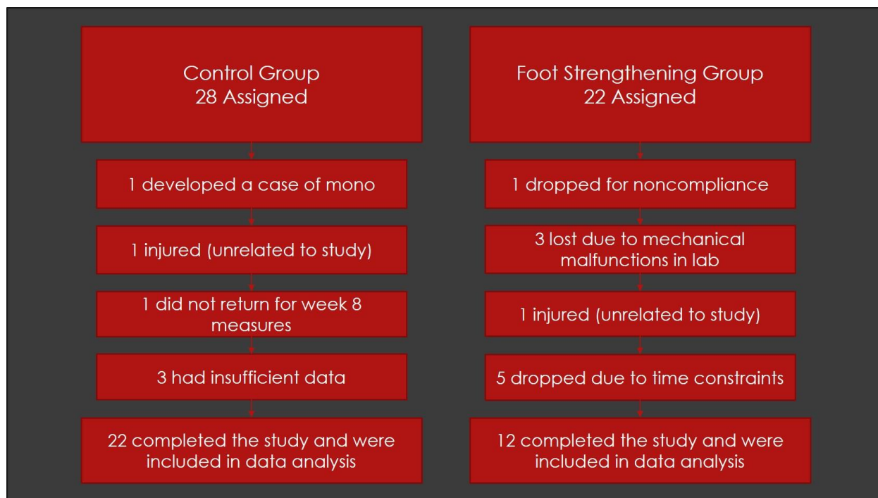
Figure 1. Dropouts from control and foot strengthening groups